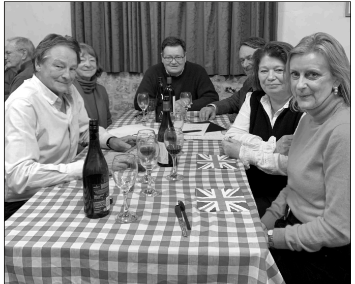
The quiz winners